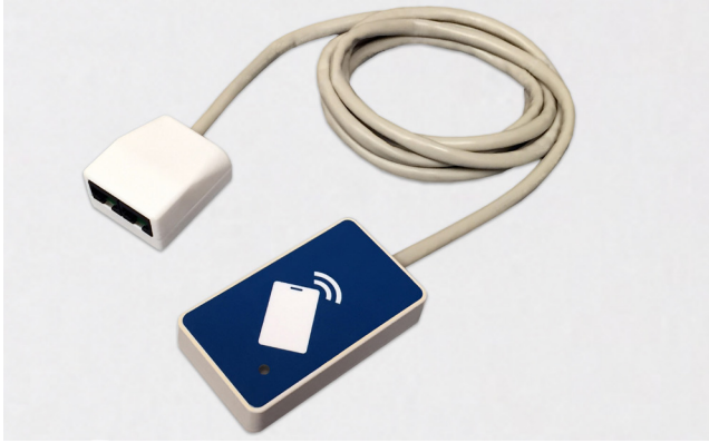
Ethernet Card Reader – extend secure document release to all print devices in your fleet.